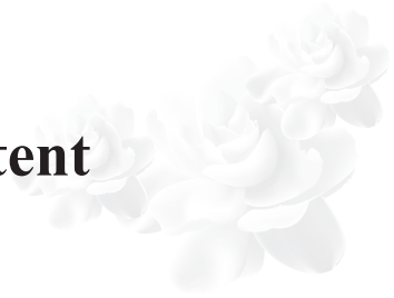
Table of Content