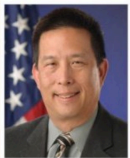
Director, NASA Ames Research Ctr