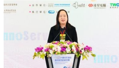
Minister Audrey Tang of Ministry of Digital Affairs