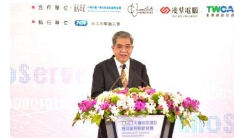
Deputy Minister Ministry of Education