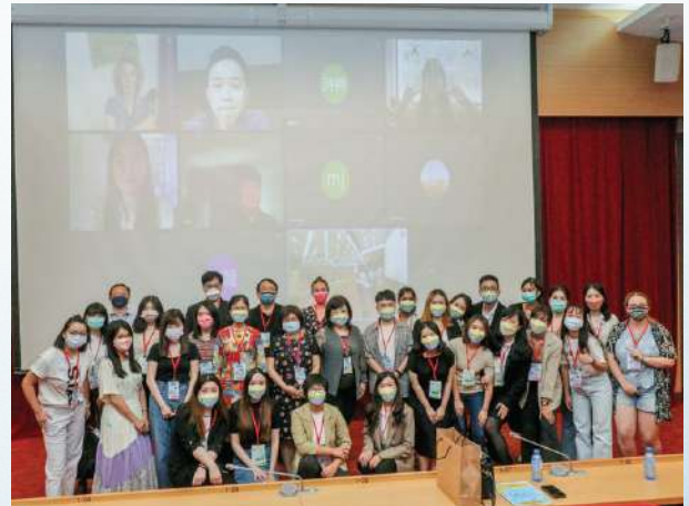
GCIT 2022 meet-up party for faculty and students in June 2022.