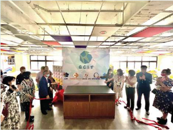
The unveiling ceremony of GCIT in June 2022.