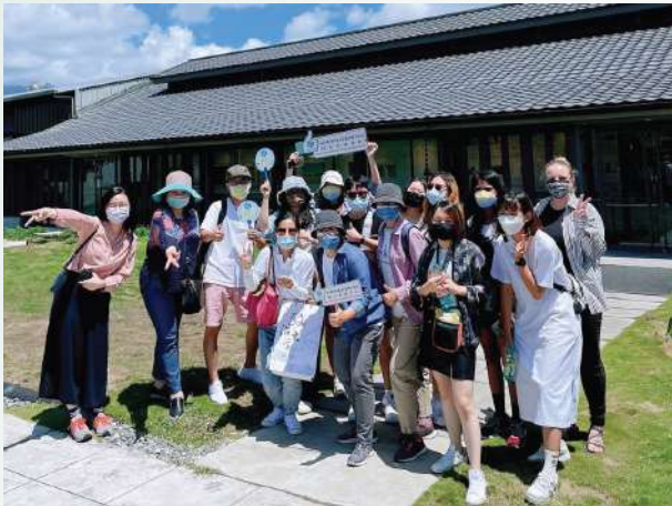
A field trip to the Chishang Art Center, Taitung in August 2022.