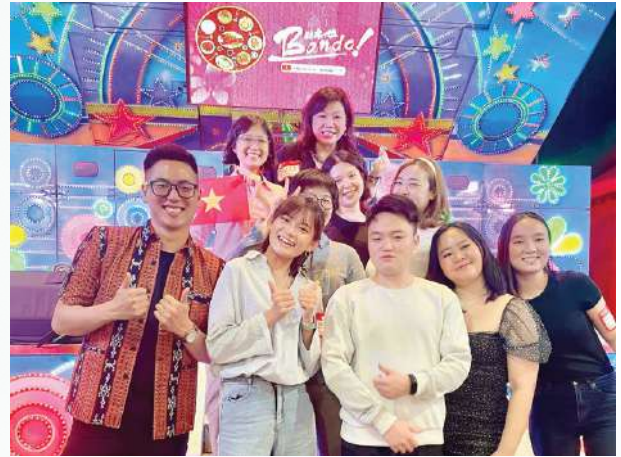
PTS World Taiwan invited the international students of GCIT for the Spring "Bando" Party in March 2022.