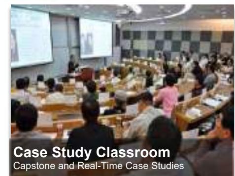
Case Study Classroom Capstone and Real-Time Case Studies

International Students ONLINE APPLICATION