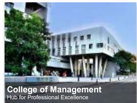
College of Management Hub for Professional Excellence