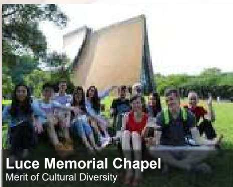
Luce Memorial Chapel Merit of Cultural Diversity