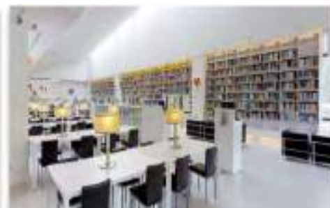
College Library Quality Business Studying Environment

The GMBA is the first English-taught MBA program launched by the College of Management as of the academic year 2018-2019. It is also the first master-level program taught in English at Tunghai University and primarily targets international students with all backgrounds.