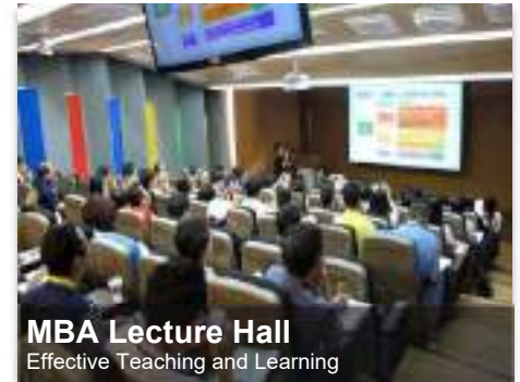
MBA Lecture Hall Effective Teaching and Learning