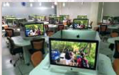
iMac Laboratory Business Project and Career Development