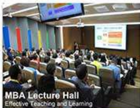
MBA Lecture Hall Effective Teaching and Learning