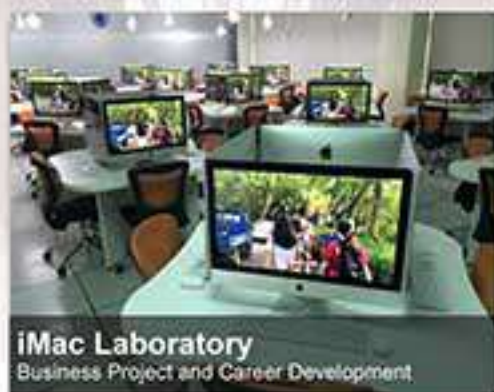
iMac Laboratory Business Project and Career Development