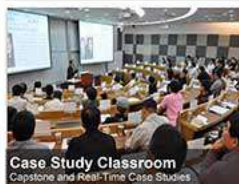
Case Study Classroom Capstone and Real-Time Case Studies

International Students ONLINE APPLICATION