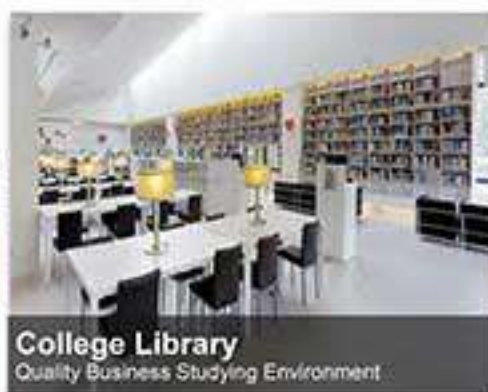
College Library Quality Business Studying Environment

The GMBA is the first English-taught MBA program launched by the College of Management as of the academic year 2018-2019. It is also the first master-level program taught in English at Tunghai University and primarily targets international students with all backgrounds.