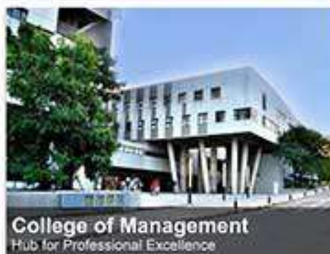
College of Management Hub for Professional Excellence