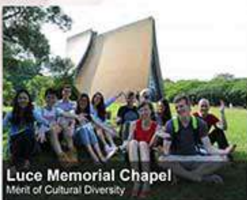
Luce Memorial Chapel Merit of Cultural Diversity